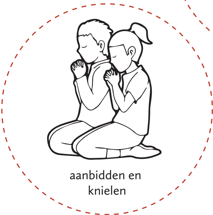
aanbidden en knielen